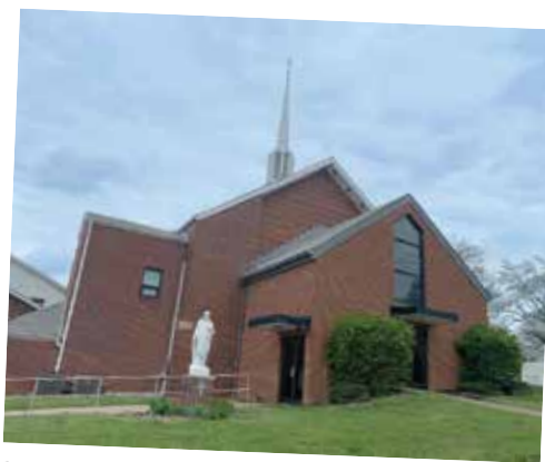
located at the former St. John the Baptist Catholic Church

We are a Maronite Catholic Church celebrating the Eastern Catholic Liturgy according to the Rite of the Antiochene Syriac Maronite Church. We are happy to be in the neighborhood and we invite you to visit us!